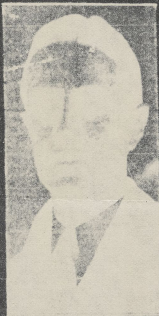
W. Averil Harriman (above) has been placed in charge of the move to transform NRA into a machine to administer the nearly 400 coded industries. Mr. Harriman spent part of last winter in Tucson.