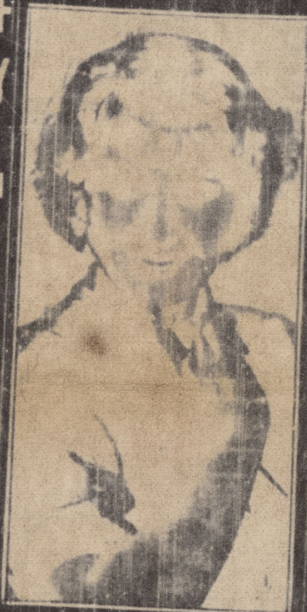
Joan Blondell of the movies, who has gone back to brown hair for the first time in her screen career.