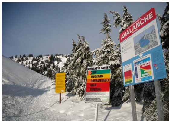
Figure 2: Trailhead sign in Mount Seymour Provincial Park.