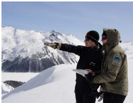
Figure 3: Field surveys for terrain assessments.

The use of ATES for slope- to mountain-scale terrain classification is a departure from its intended use as a descriptor of the overall seriousness of a particular route. However, we found that a combination of the ATES technical model, public communication model, as well as the Avaluator (Haegeli and McCammon, 2006) Trip Planner (i.e. would this terrain be not recommended during considerable danger) worked well to subjectively classify slope- to mountain-scale areas, as long as low precision and large scale maps ensured adequate accuracy. That is, it worked well as long as the maps weren't too detailed and the polygons were broad-strokes applied to general areas.