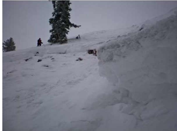
Fig. 2 Crown close up from near trigger point

After 5 days in a chemically induced coma, Max was brought out and made a full recovery. From dispatch logs, 39 minutes elapsed between the original 911 call to Canyons Dispatch and the time his head was exposed. We estimate an actual burial time closer to 45 or 50 minutes.