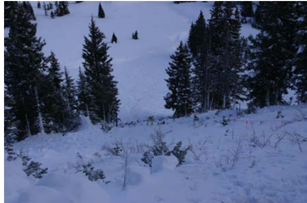
Fig 5. Looking down to debris field from mid-slope, photo taken 12/24/07