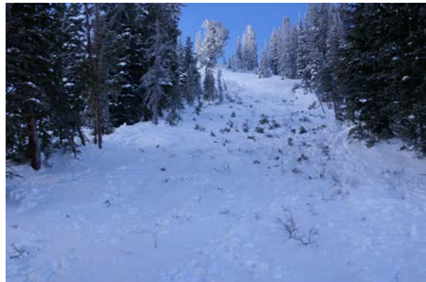
Fig. 3 Looking up track from top of debris