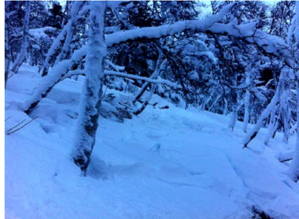
Figure 3. Skier triggered avalanche in Åre, Sweden.

During winter 2013, several skier-triggered avalanches occurred near the ski resort Åre, Sweden, both in open mountain terrain and in forest. They were released due to a weak layer of facets (pers. comm. Mårten Johansson, Åre Avalanche Center). The weak layer was a result of weeks of cold weather after rain. A rain crust worked as a vapour barricade, and a high temperature gradient built a layer of facets below the crust. The avalanches in the birch forest were small avalanches, size 1, according to the Canadian size classification.