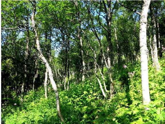
Figure 5. Summer photo from one of the release areas in Åre.