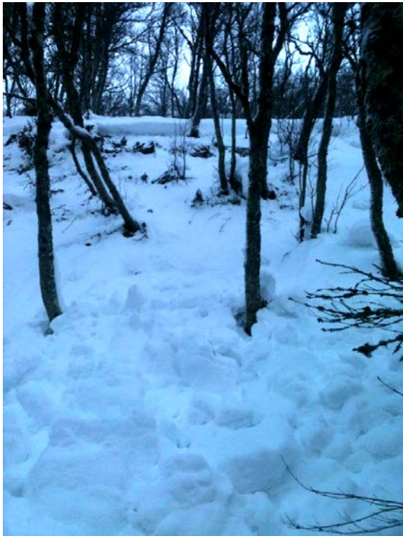
Figure 2. Avalanche in Åre, Sweden, around New Year 2012.

We have especially studied two cases of skier-triggered avalanches released in birch forest in Åre, Sweden (figs. 2 and 3). Information (snowpack, gps-position and photos) on these avalanches were provided by Åre Avalanche Center and the release areas visited the following summer.