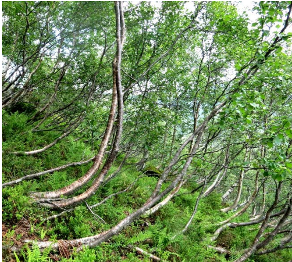
Figure 1. Typical, relatively young birch forest in Hornindal with stems affected by snow movement.

avalanches some birch trees show few or little damages, but according to Lied and Kristensen (2003) most birch forests will die if the avalanche frequency is higher than about 4 years.