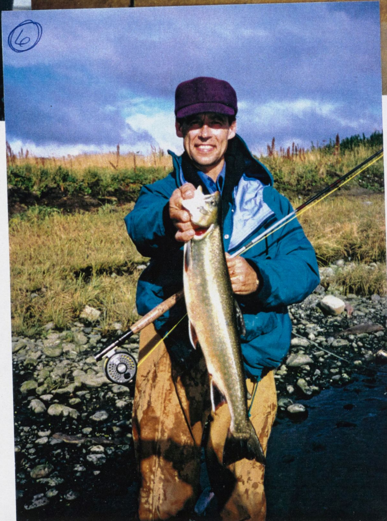
3LB KARLUK RIVER, AK 9-23-95 NO TIDE MANIS