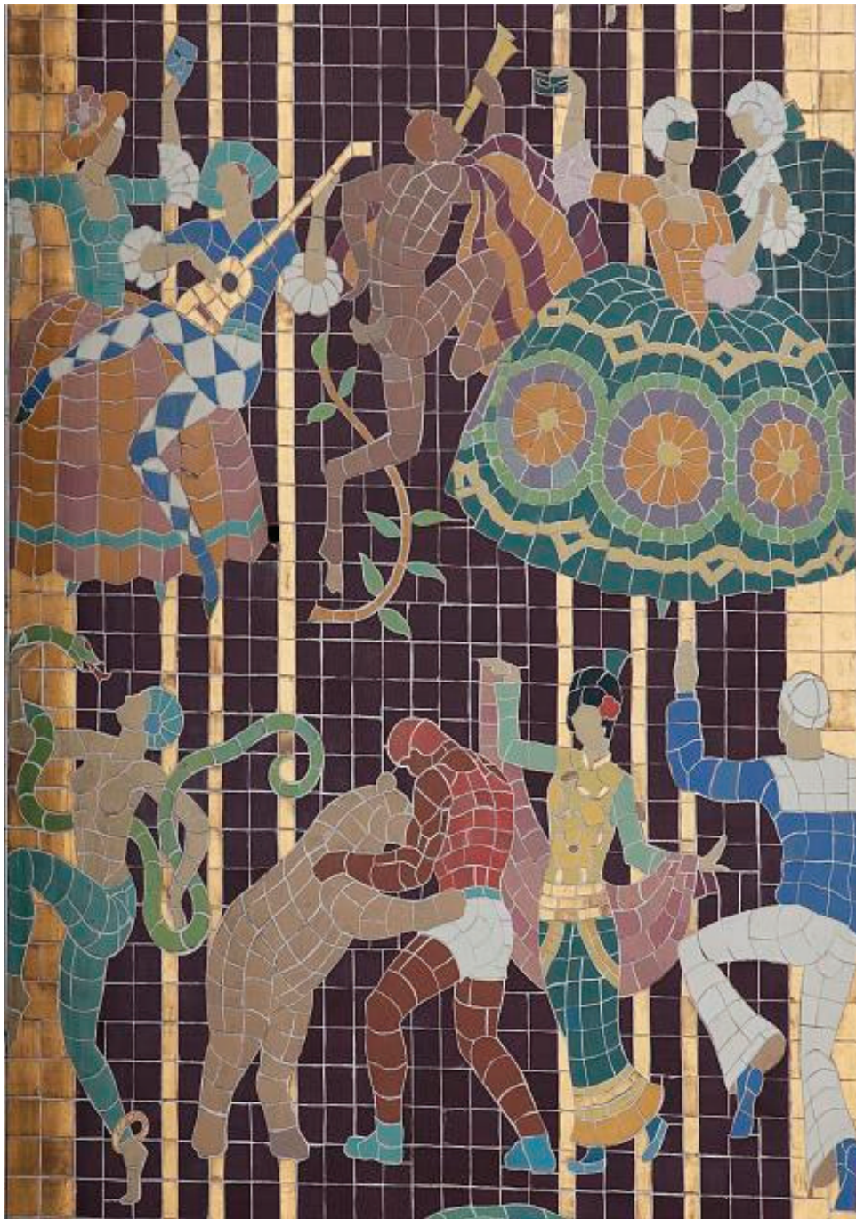
Paramount Theatre building detail, Oakland, California

The official journal of the Pacific Northwest Library Association