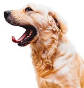
Figure 2: Taylor (2016)