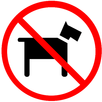
(Pixabay CCO Public Domain, n.d.)