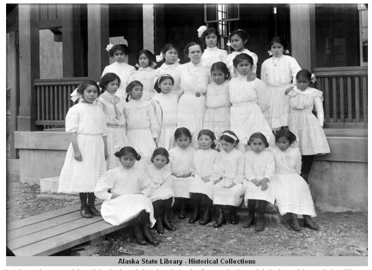
Figure 5: Class photographic, Sitka Industrial School. (n.d.) from Alaska's Digital Archives. (Merrill).