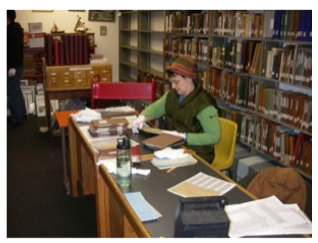
Figure 3: Community volunteer conducting inventory of archival materials at Stratton Library in Sitka, Alaska. 2008.