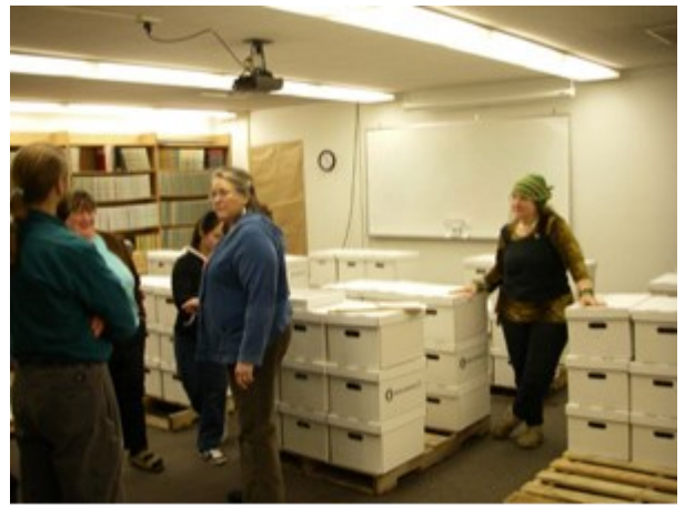
Figure 2: Community volunteers moving materials to safe room at Stratton Library in Sitka, Alaska. 2008.