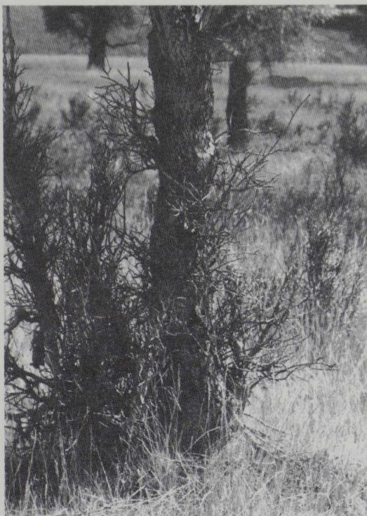
Figure 3. A released-type cottonwood. In its youth, this tree resembled the cottonwood shown in Fig. 2. Evidence of retrogressed-type architecture is preserved in the dead stems at the right-hand side of the lower trunk. Above the point where retrogressed-type stems are attached to the trunk, trunk girth diminishes markedly. The large girth at point of attachment indicates that the dead stems were produced early in the tree's life. The near-vertical orientation of those stems indicates that they developed before elongation of what is now the trunk. A reduction in browsing intensity enabled a stem of the retrogressed-type plant to grow to ca. 4 m tall, producing the released-type architecture. Lateral branches within the browse zone have been intensely browsed, indicating that browsing level increased to intense after the trunk grew through the browse zone.

and 1 m to the uninterrupted-growth-type category. The continuity of the primary stem was evidence of uninterrupted-growth when the terminal leader grew within that zone.