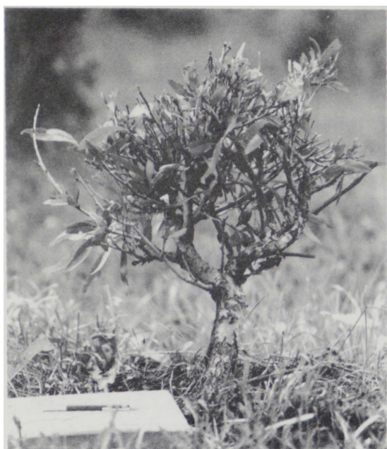
Figure 1. A bush-form (arrested-type) cottonwood about 50 cm tall growing adjacent to the Gardner River north of Mammoth Hot Springs, Yellowstone National Park. Ungulate bite-marks are visible on many branches. Above a height of about 20 cm, the primary stem branches profusely, indicating that stems were intensely browsed once they grew taller than the protection afforded by snowpack.

thickness. In a 17 year old stand of arrested-type cottonwoods located 5.5 km upstream from this study area (elev. 2050 m), average height was 18 cm; the tallest arrested-type individual was 42 cm (Keigley 1997b).