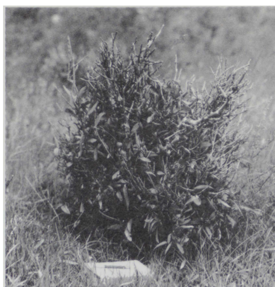
Figure 2. A retrogressed-type cottonwood about 75 cm tall growing adjacent to the plant in Fig. 1. In contrast to the flat-topped appearance of the plant in Fig. 1, this individual has three protruding stems. The ability of these stems to grow to 75 cm tall indicates that, early in its life, this plant experienced less intense browsing than the plant in Fig. 1. The upper portion of this retrogressed-type individual is dead. Leaves are borne on lateral branches that developed from the base of the plant.

Retrogressed-type architecture is produced when browsing changes from a light-to-moderate level to an intense level. During the early period of light-to-moderate browsing, the plant may grow taller than the arrest zone (i.e., taller than 40-50 cm). When the browsing level changes to intense, the upper region of the plant's primary stem dies. A dense thatch of dead branches may form and protect new lateral branches that may develop from the lower region of the plant (Fig. 2). At the site previously described by Keigley (1997b), retrogressed-type cottonwoods