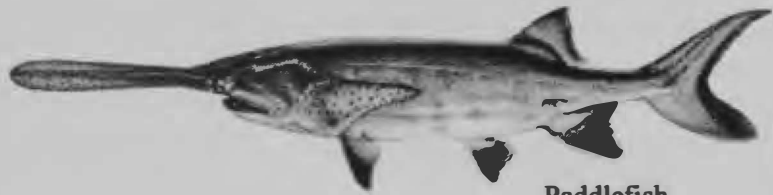
Paddlefish Polyodon spathula