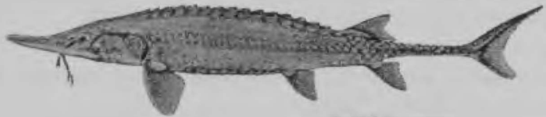
Pallid Sturgeon Scaphirhynchus albus