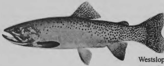
Westslope Cutthroat Trout Oncorhynchus clarki lewisi