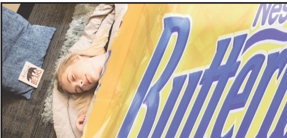
Failure to be safe while camping in bear country could have you sleeping in a proverbial candy bar wrapper, waiting for bears to find you.

Footnote: if you do encounter Bear Grylls in the woods, be sure to have a pouch of Mexican Mealworms handy. Scatter them on the ground nearby and slowly back away. He'll go after the bugs before he goes after you.