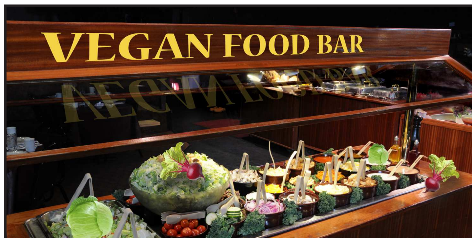
A vegan food bar.

Having options besides meat-heavy burgers and greasy, cheesy pizzas on campus would be much healthier for students. They propose having carbonated, yet healthy beverages such as LaCroix and Bubly to keep the fun, while removing the sugar. FOV is in full support of this switch and excited to help out with the implementation. Voting will take place at an ASMSU senate meeting after the upcoming election, so stay tuned.