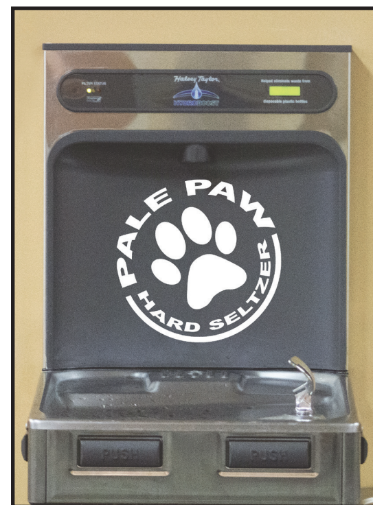
MSU's brand new Pale Paw fountains stand ready to fight underage binge drinking in the SUB.

Some community members did raise concerns that the pipeline could burst — potentially contaminating local water supplies. McSeltzer was quick to point out that such an occurrence is unlikely to occur if proper precautions are taken. To allay fears, MSU will be recontracting the same company used in designing the newly completed Open Sky Fitness Center. Students can look forward to seeing Pale Paw stations around campus and the downtown area beginning in the fall of 2019.