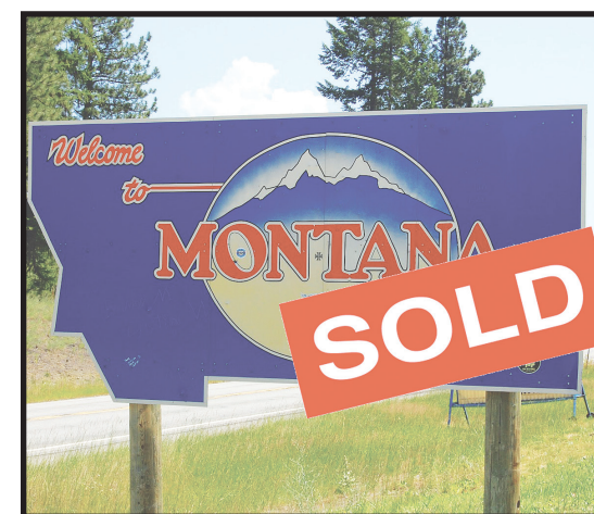
Look at that! You're Canadian now, eh?

Becoming Canadian is going to suck. We are all going to have to be nicer people and invite our friends over for weekend cookouts. The skiing is awful, hockey is one of the only sports to watch and the tuition is too affordable to be true. Why did our government do this to us? Why did they abandon us to these monsters? WHY?