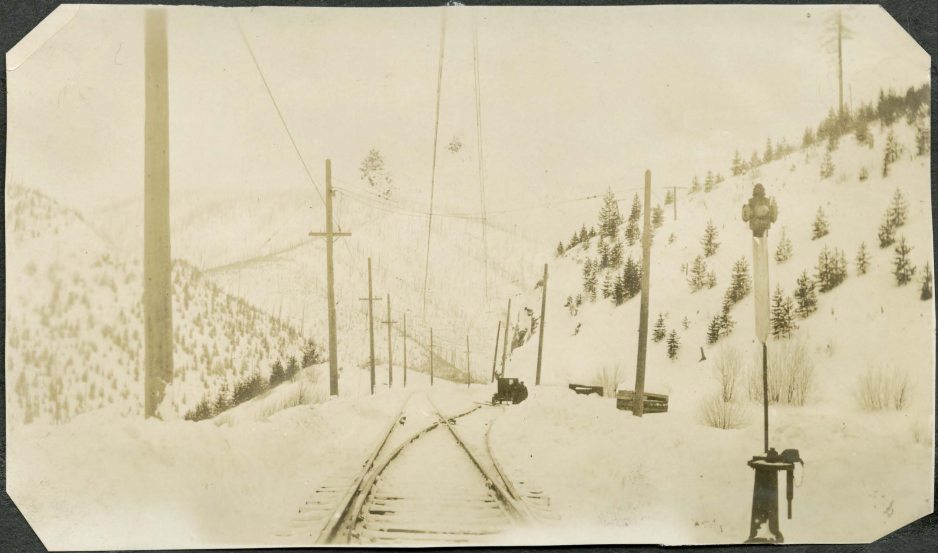
Ringling's Pades Cattle.