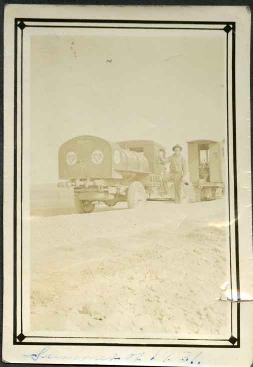
Summer of 1936