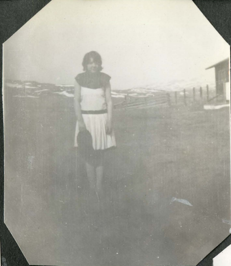
Center and right, Mother