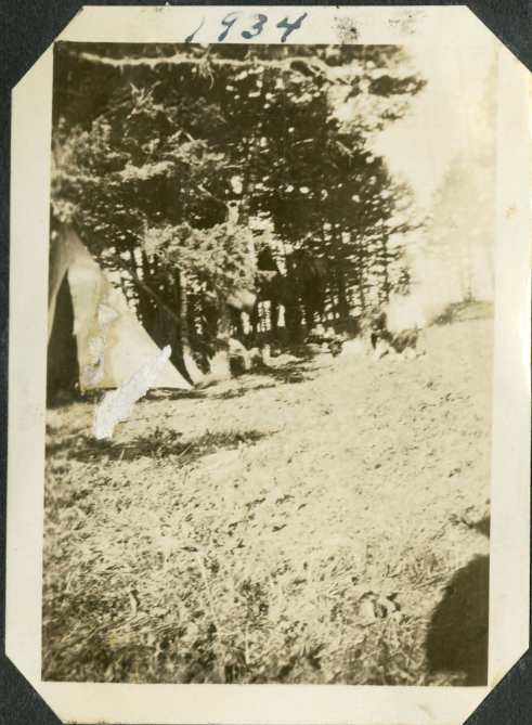
Dad during the Wall Cross Mtn. summer.