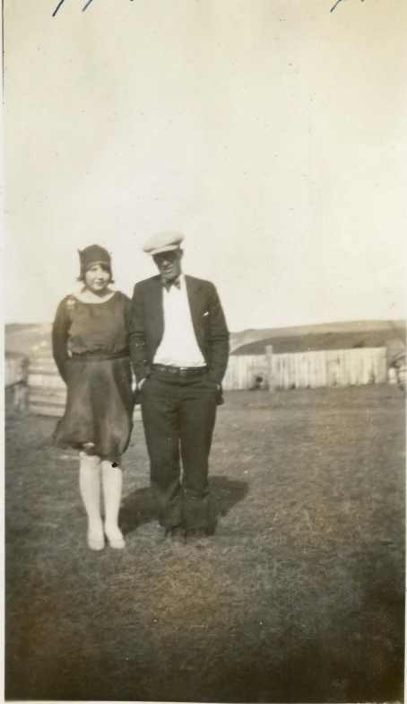
Mother and Dad