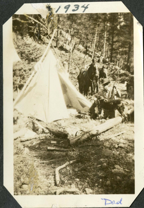
My parents, during summer of herding sheep for the Dogie ranch on Grass Mtn.