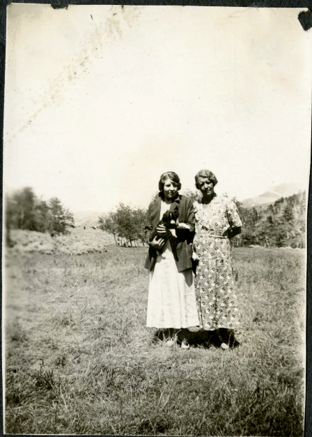
Mother and Grandma, on or near Grass Mtn. Wall Mtn is in right back- ground.