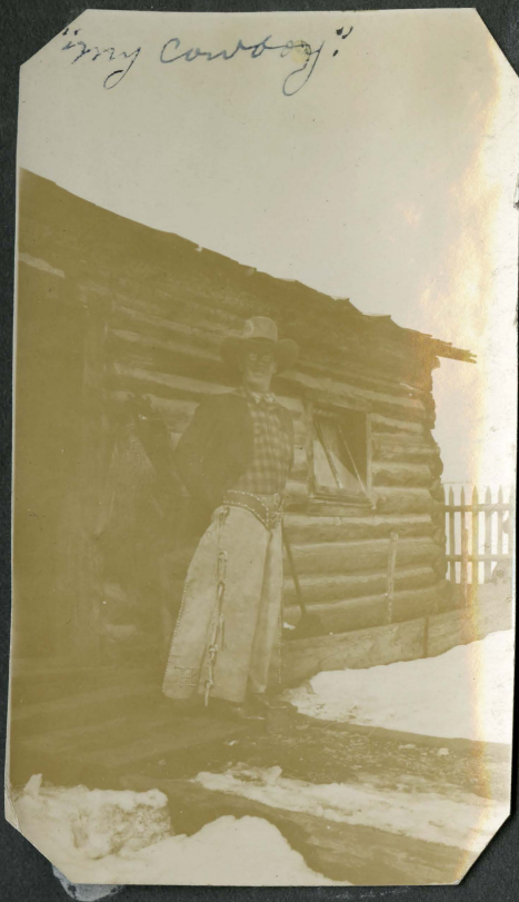
Dad, at Doig ranch. (window is Anne's bedroom)