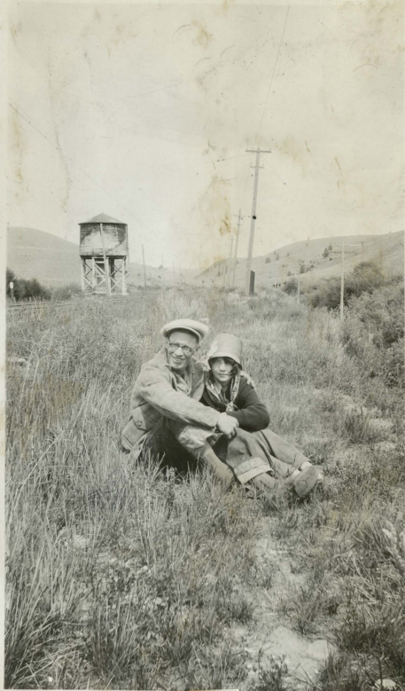
Dad and Mother