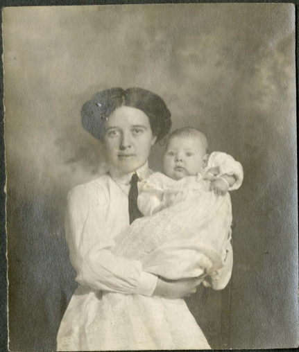
Grandma and my mother