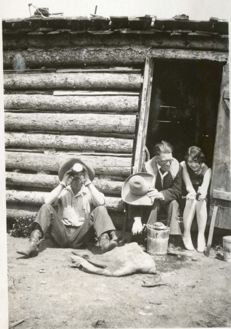
Dad and mother on right, at Doig ranch.