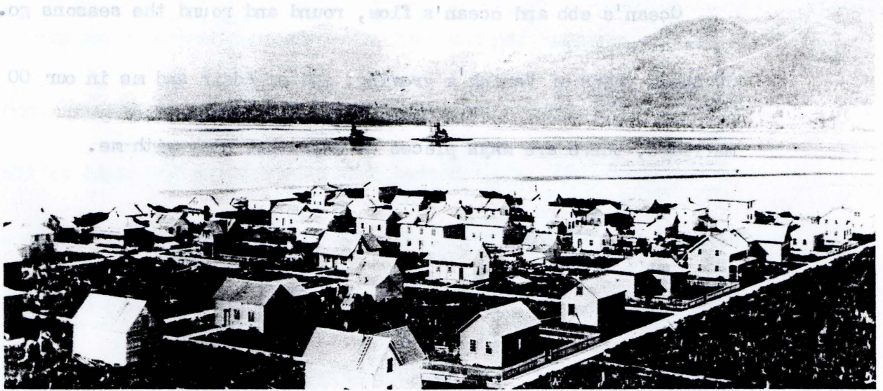
Missionary Duncan and his Tsimshian elders diplomatically laid out their new town with every house occupying a corner lot, thus avoiding intratribal disputes over choice properties.

latch, the custom of giving away all of one's goods to earn increased respect and status.