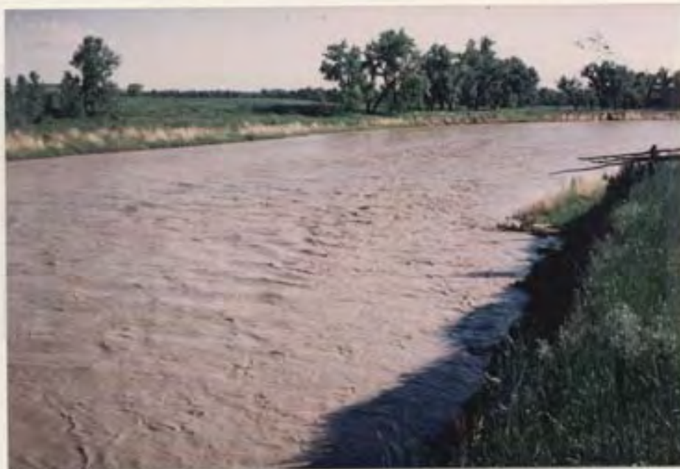
Figure 9 -- The consequence of continuous grazing and trampling.