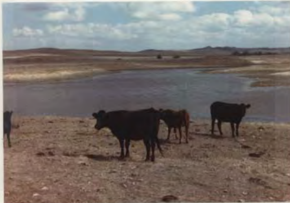
Figure 7 -- Prickly pear cactus also established widely. It is often masked by taller growing vegetation and not seen.