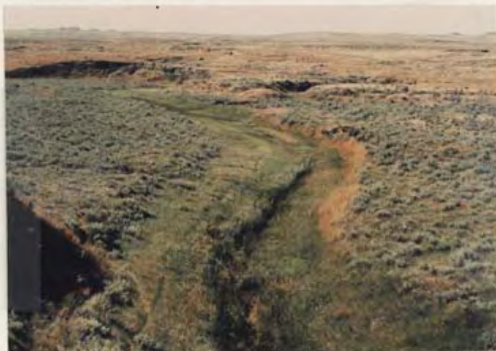
Figure 2 -- The conifer and sagebrush types occupy thin soil areas in drainage ways and on slopes and ridges.