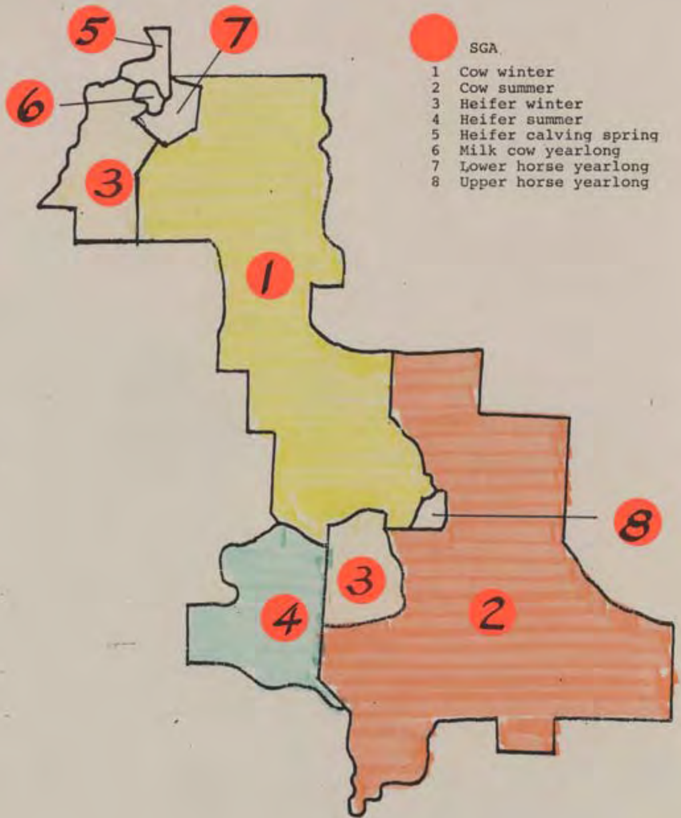
Figure 38 -- Seasonal Grazing Areas (SGA)