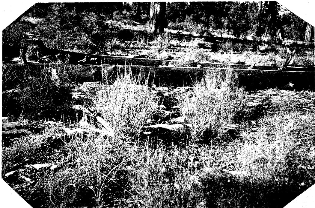
Photo No. H-627 November 21, 1941 Before grazing. Looking N across chain 1.

On Gas Drum Flat Road, 6 miles south of Mowitz Butte-Badger Well turn. West side of road.