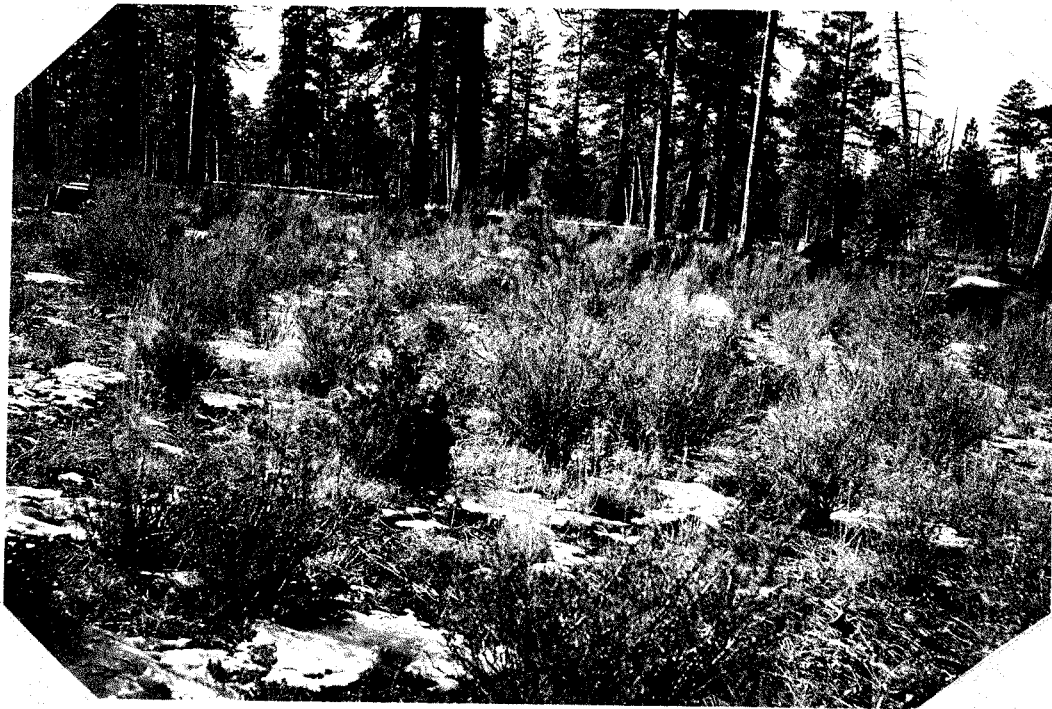
Photo No. H-631 November 22, 1941 Before grazing. (No location given)

On the Wart on Tree-Badger Well Road, 1.60 miles south of road intersection. West side of road.