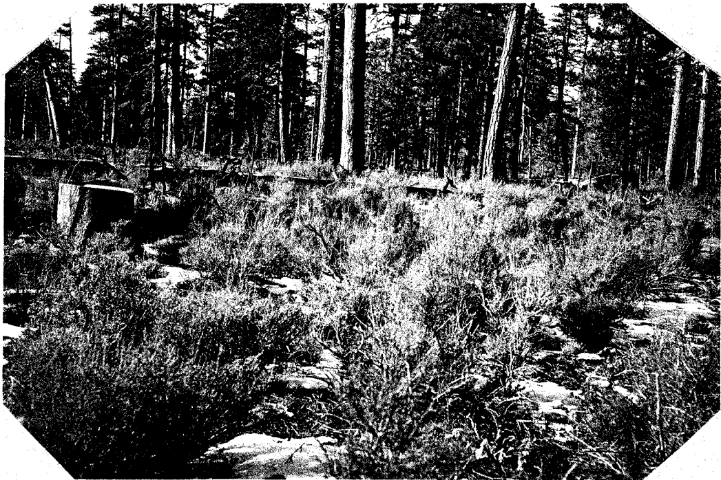
Photo No. H-626 November 21, 1941 Before grazing. Looking west along chain 1.

On Gas Drum Flat Road, 4.80 miles south of Mowitz Butte-Dadger Well turn. West side of road.