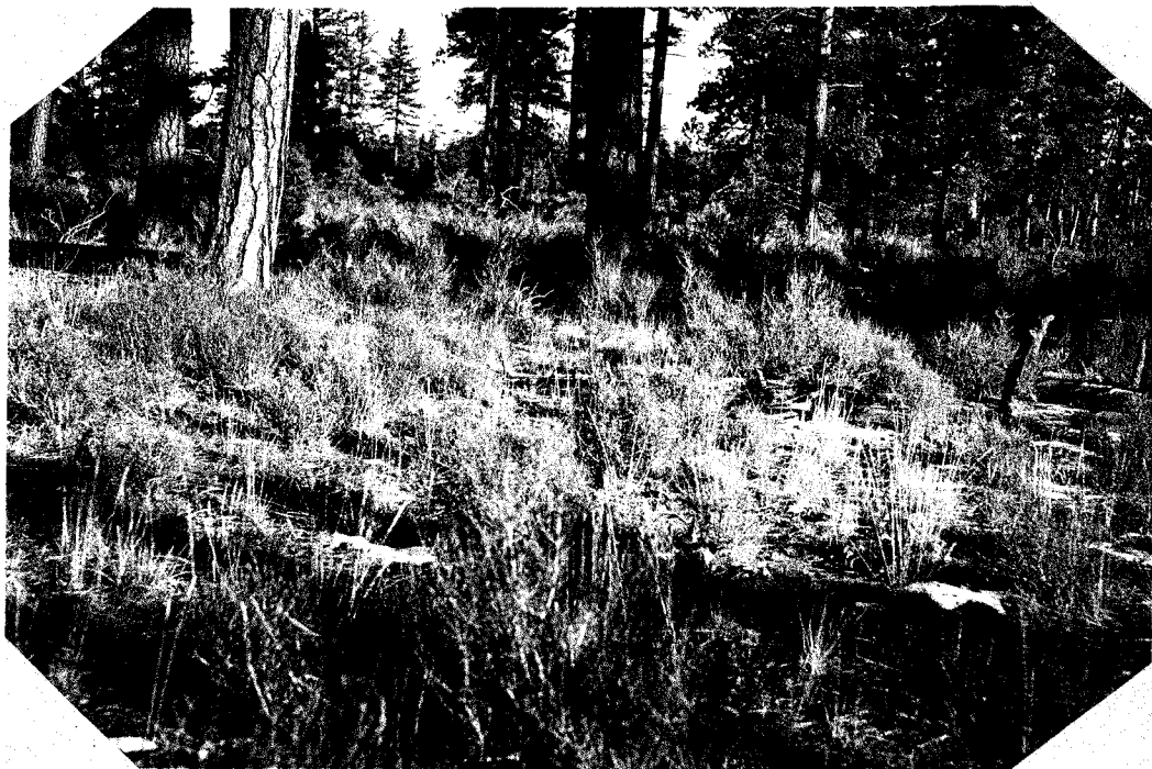
Photo No. H-628 November 21, 1941 Before grazing. Looking East along chain 1.

On the Wart on Tree-Badger Well Road, 4.70 miles south of road intersection. North side of road.