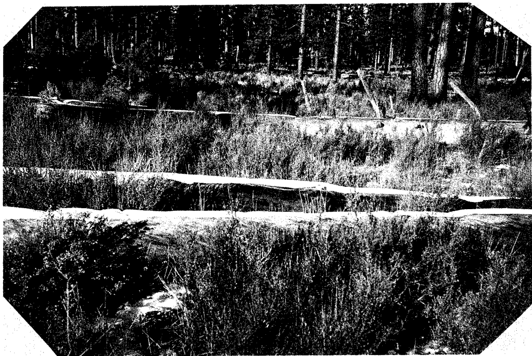
Photo No. H-630 November 22, 1941 N Before grazing. Looking 1\frac{1}{2} chains SW of chain 1 looking SW.

On the Wart-on Tree-Badger Well Road, 2.70 miles south of road intersection. West side of road.