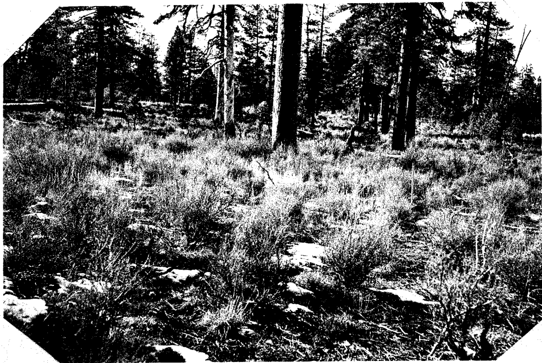
Photo No. H-632 November 22, 1941 Before grazing, Northwest across chain 2.

On the Browns Well-Badger Well Road, Northwest across chain 2. West side of road