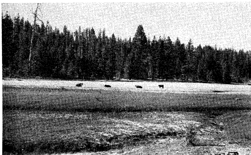
FIGURE 1. Continuous grazing of particular forage plants and range areas by livestock is the prime cause of range deterioration.

At the Burgess Spring Experiment Range about 29 per cent of the Idaho fescue stand in the pine-timber type was destroyed by 8 years of moderate seasonal grazing. As closely grazed sites become bare and exposed to soil erosion or become covered with less desirable forage species, depending on local circumstances, livestock are forced to graze the less desirable species or move to less accessible areas. This process leads to ever-enlarging areas of deterioration. Range breakdown is spotty because of selective grazing. Also some sites deteriorate more rapidly than others under the same grazing pressure because of differences in soil, slope, vegetation and related factors. Evidence that ranges deteriorate in this manner is stamped on practically every mountain range in northeastern California.