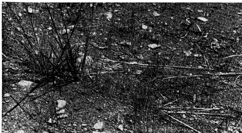
FIGURE 3. Improvement and maintenance of the range and maximum sustained livestock production depend on the continuous establishment of reproduction of desirable forage species.

the Lassen National Forest in northeastern California. This allotment encompasses more than 32,000 acres and has a grazing capacity of 500 animal-units at present. The grazing plan requires use of five range units. The first overall appraisal of the effectiveness of the plan in increasing grazing capacity on the allotment will be made in 1960 when each of the units will have had one opportunity to produce a seedling crop. The results obtained to date are