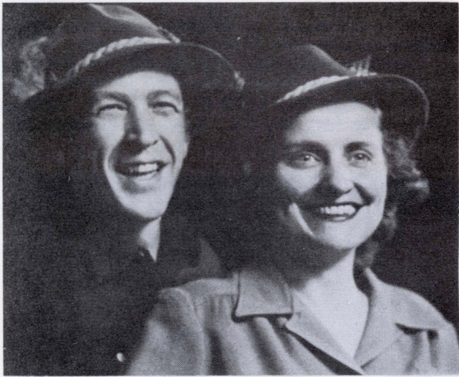
The Trail Merchants