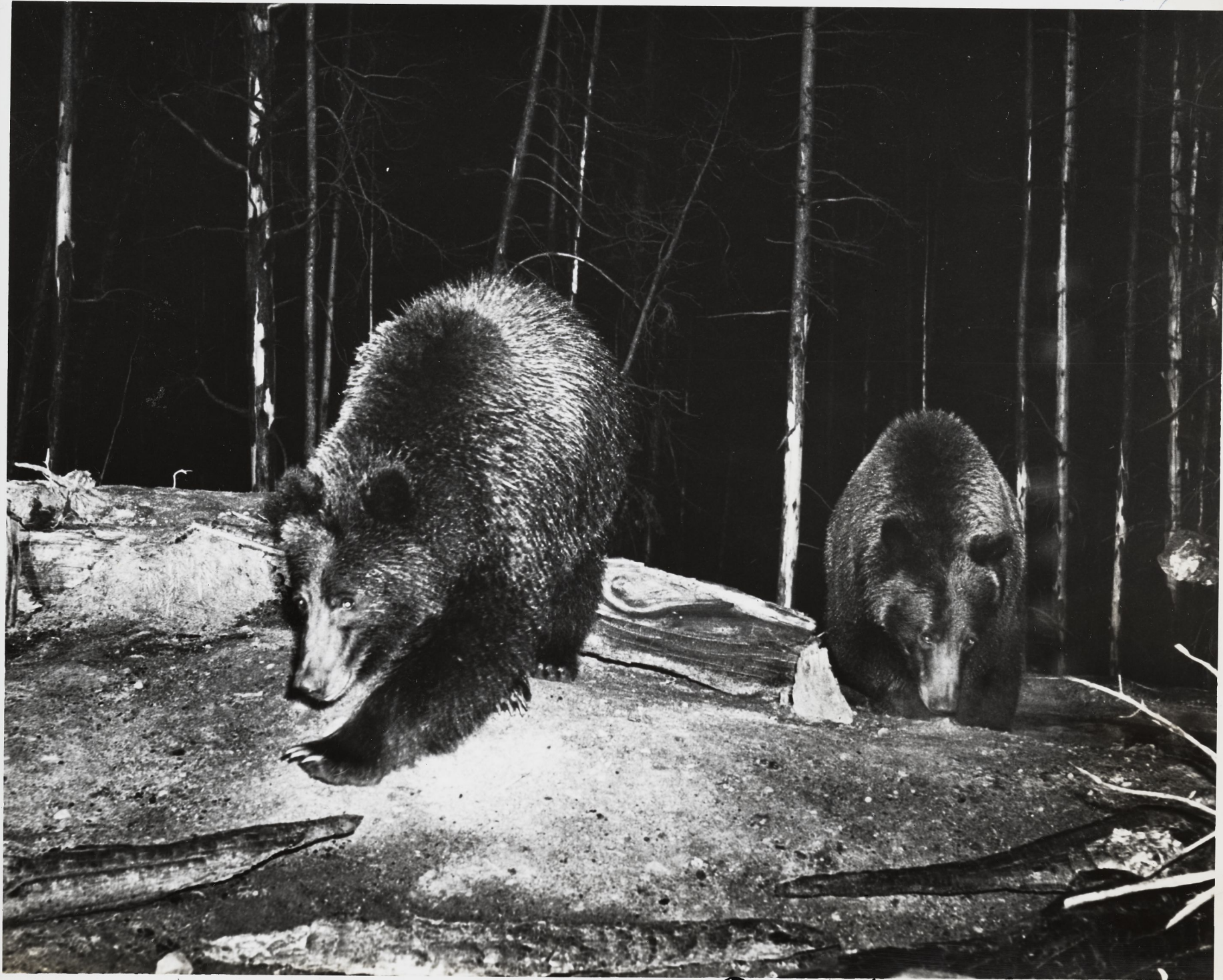
"TWINS" © 1963 by Norman Wels Casper College Casper, Wyo.