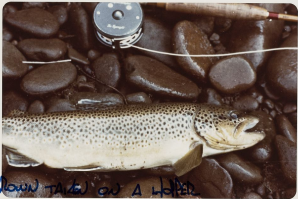
Brown TAILED ON A HOPPER