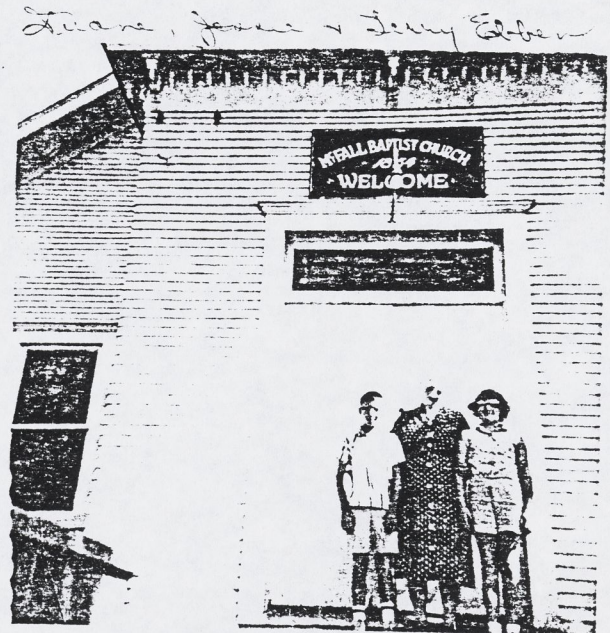
Central part dates to 1854