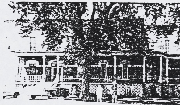
Wabash House Hotel 8-16-67