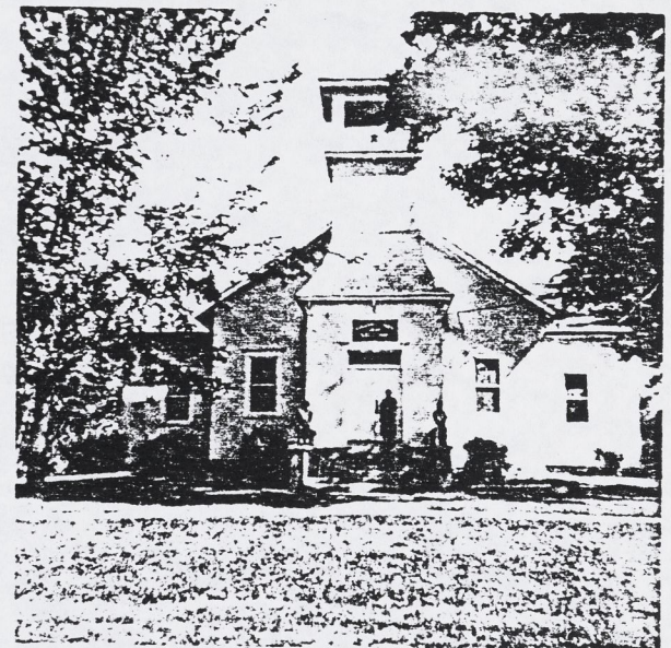
McFall Baptist Church