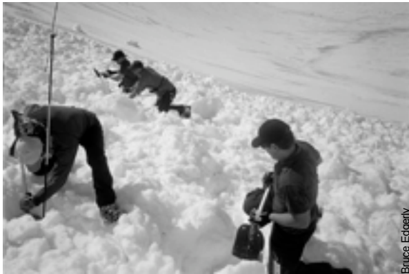
Figure 4. Shoveling side-by-side (background) was more efficient than shoveling in line (foreground). In the latter technique, the primary rescuer shoveled tentatively and the secondary shoveler was often idle.

holes with steep sides and lack of maneuverability. Tests with more than one rescuer confirmed greater efficiency operating side-by-side, as described above, than in line. Rescuers using the latter technique would always shovel more cautiously and tentatively to avoid striking the secondary shoveler with snow or their shovel blade. Invariably the secondary shoveler would be waiting for shovelfuls of snow from the primary shoveler so he could then move that snow from the area (Figure 4). While this provided needed rest for the secondary shoveler, it was an inefficient allocation of manpower compared to the side-by-side method.