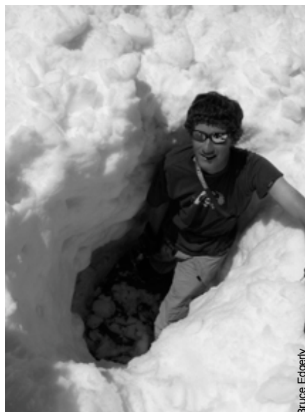
Figure 1. Excavating with no strategy usually produces a hole which compromises the victim's air pocket and the rescuer's maneuverability.

directly on top of the victim, compromising the air pocket. Rescuers would invariably excavate in a cone shape down to the victim. Once deeper than their waists, rescuers were no longer able to throw snow clear of the hole, but had to lift it above the sides and deposit it. This creates high walls around the hole and exacerbates the problem of removing snow from the excavation area. By the time the rescuers reached the victim, the snow being removed often came right back into the hole and on to the victim again. It is not difficult to imagine the stress and possible harm this would cause to a live avalanche victim.