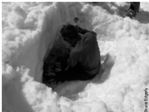
Figure 2. Proper terracing allows better snow removal and maneuverability for the rescuer. Sitting or kneeling is more ergonomic than standing.

creating a “terrace” effect up to the surface, as suggested by Pfisterer. The starter hole already excavated enables shovelers to throw snow clear of the hole instead of lifting and depositing it on the sides (Figure 2).