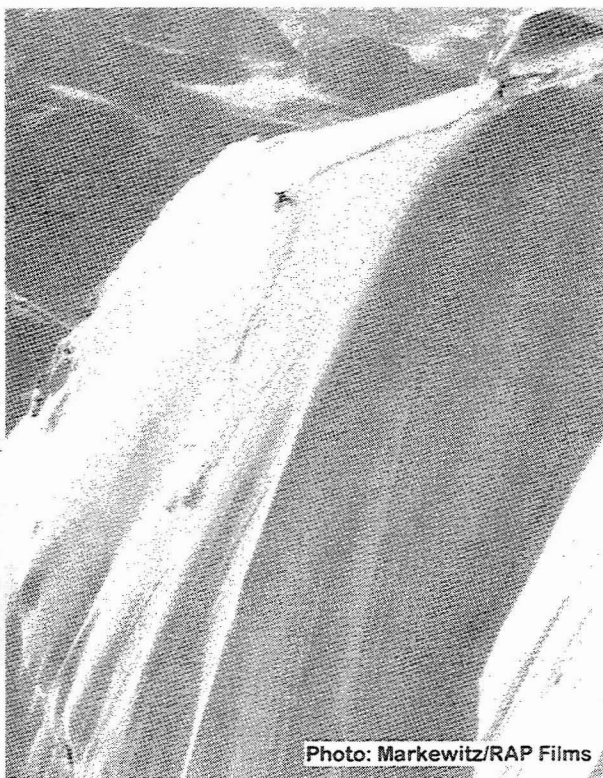
Figure 2. Skier Eric Pehota cuts above a 50+ degree face before descending. In spite of this cut he will still need to be alert for additional sluffing on this steep exposed face.

Ski Cutting - Ski cutting is probably the most traditional method of controlling sluff activity. In many cases it will serve to eliminate the chance of sluffing during a run. On the other hand, enough loose snow may remain to create a substantial hazard, especially on the steepest slopes. But the experienced steep skier may be reluctant to cut slopes for aesthetic reasons. This might be for the pure powder experience or a film shoot. Where the skier is confident in his ability to negotiate the terrain and sluff paths, he may prefer to deal with the sluff during the run, rather than control it ahead of time. The guide, through communication with the client, determines what is advisable in each situation.