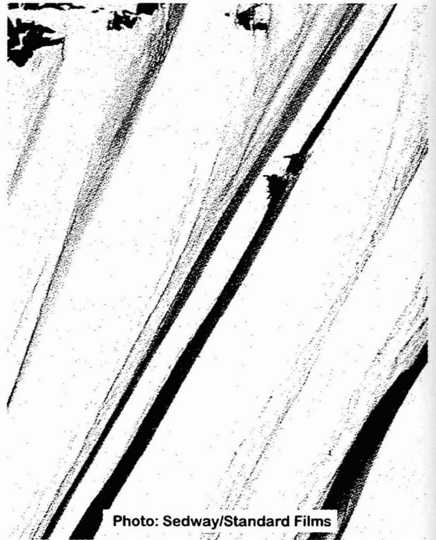
Figure 1. Senior guide, Dave Swanwick makes use of a spine to isolate himself from his sluffs on a 55 degree face..

another good terrain feature, as the snow falls to either side and away from the skier. The spine must be big enough that the skis are not near the right or left edge of the spine where it meets the sluff path. A skier must also be alert if a spine ends at a point where the sluff path on either side converges. In all cases, care must be taken to avoid terrain features which enhance the sluff, such as gully bottoms and narrows.