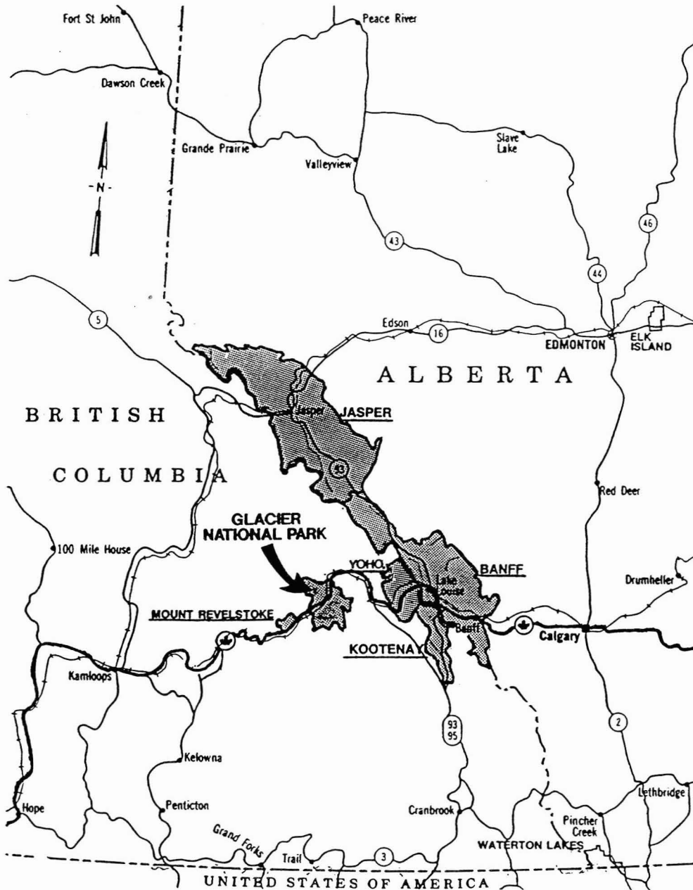
FIGURE 1. Regional Setting of Glacier National Park.