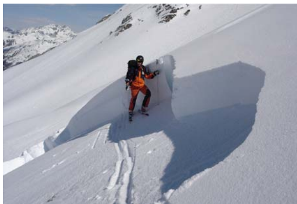
Figure 1: Crown fracture of a skier-triggered avalanche which released on a layer of surface hoar.

Displacement-controlled experiments give insight into the material behavior before fracture. However, to study fracture itself, and in particular the processes that lead to fracture, load-controlled (or force-controlled) experiments are needed.