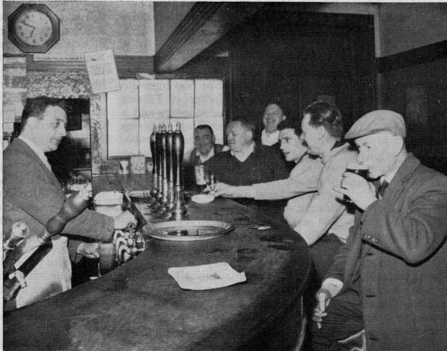
—Irish Tourist Board