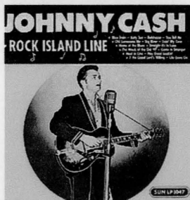
Johnny Cash's 1970s album, Rock Island Line