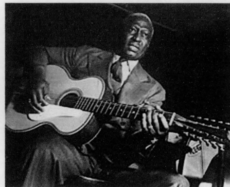
Lead Belly playing his twelve string guitar