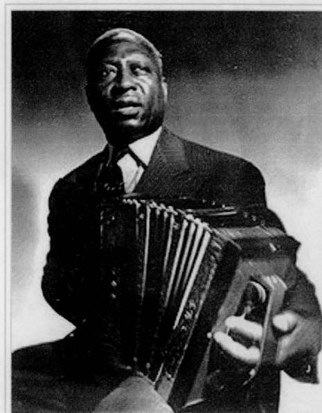
Lead Belly playing an accordion.

Influenced by the sinking of the RMS Titanic in April 1912, he would go on to write the song "The Titanic", [4]