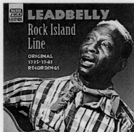
Cover of the Leadbelly compilation Rock Island Line: Original 1935-1941 Recordings